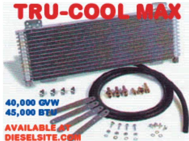
PHOTO: These fittings come disassembled as four separate pieces in the TRUCOOL 4739 box. You will use these fittings to connect the hoses. Using the photo below match and then join the pieces to make a union that you will use when you connect the hoses during installation.

7. Reinstall your grill and you are done!